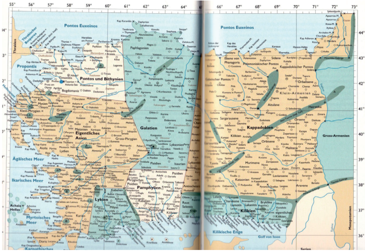
Fig. 1a. Reconstruction of Ptolemy's "Asia's map 1", after Stückelberger and Grasshoff 2006. P. 846–847.

In all three chapters, the first paragraph (5.1.1; 5.4.1; 5.6.1) is dedicated to a brief description of the general borders of the region, in one of the rare cases of short texts (not in the form of lists with names and co-ordinates) in the Geography . Only in the first instance, there are also paragraphs (5.1.2–4) dedicated to the western coast, that of the Propontis. Similarly, in all three chapters, the description of the coast is followed by that of the hinterland, the reference to the most noteworthy mountains of each region, while some of the indigenous peoples are also mentioned (e.g. in 5.1.11; 5.4.5; 5.6.2; 5.6.6). In the case of Pontus and Bithynia in particular, 5.5.15 is dedicated to the islands of the region, which for the rest are absent from the Black Sea 4 .